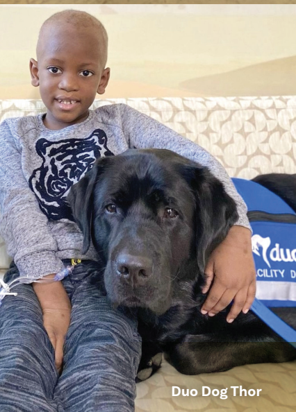
Duo Dog Thor

“ We are so lucky to have Duo Dog Thor on our Child Life team at SSM Health Cardinal Glennon Children's Hospital. Over the last year, Thor and I have provided over 2,300 Child Life interventions to help patients cope with hospitalization and collaborated with Cardinal Glennon's outpatient Sexual Abuse clinic, to provide support in over 30 exams. Thor's presence in the hospital environment has impacted our patient outcomes significantly. ”